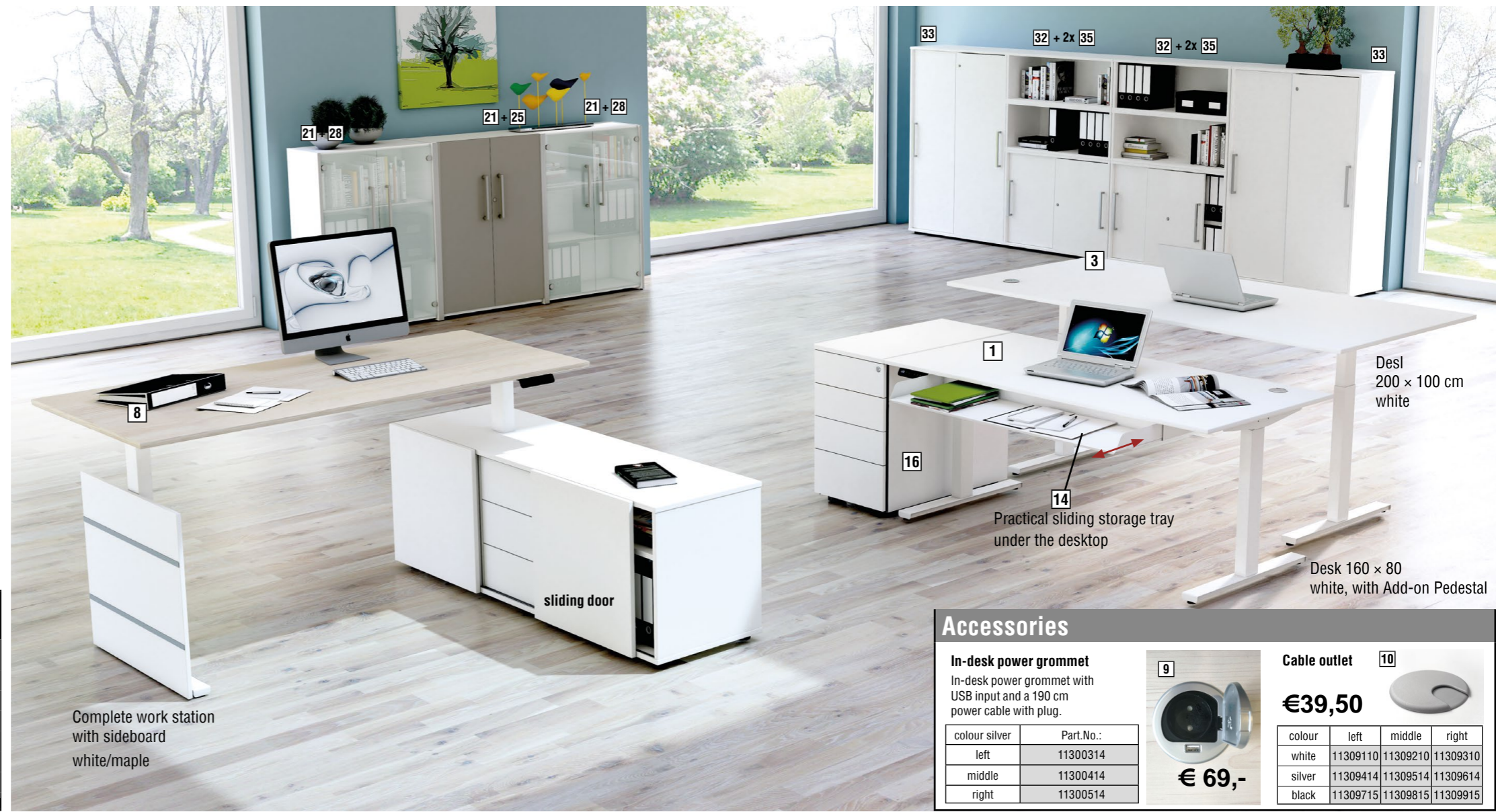
Complete work station with sideboard white/maple