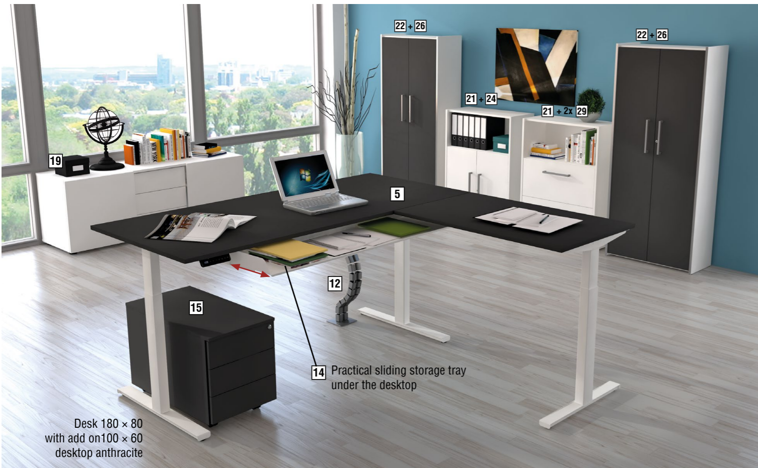
Desk 180 × 80 with add on 100 × 60 desktop anthracite